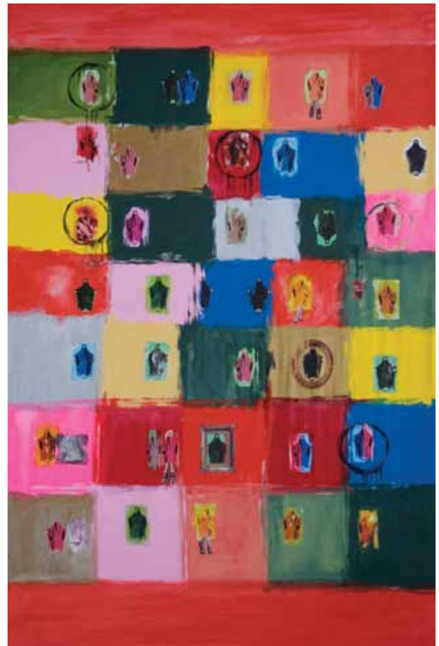
Contradiction, 2011, Collage, Calligraphy and acrylic on Wood, 168x112cm - Courtesy of Salwa Zaidan Gallery.

FM: I look for things that inspire me and trigger my creativity whether it is through a book I am reading be it a novel, historic or poetry. I usually search for elements to support the ideas I have in mind and help