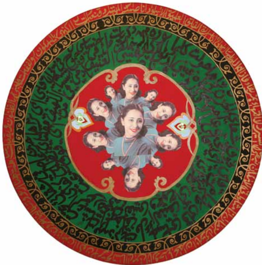
Nazikalmalaeka , 2010, 121cm Diameter, Acrylic, Collage and calligraphy on wood - Courtesy of Salwa Zaidan Gallery.

supporter of female development in all fields especially art. This drives me to seek and fulfill my full potential through every piece I create and feel compelled to better represent my people to the best of my ability. Challenges are always there, being part of a conservative society, yet things are changing positively rapidly.